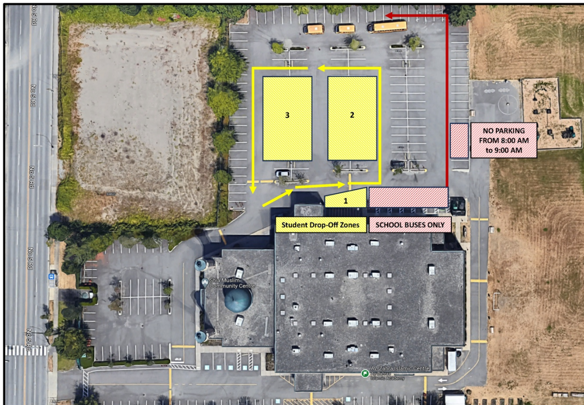
Az-Zahraa Islamic Academy Morning Traffic Flow

For the safety of all students, parents and family members, we ask all drivers to please drive slowly and carefully in the parking lot. Please allow our school bus the right of way and plenty of space to enter and leave the main gates of the school. Also, for morning drop-off and after school pick-up, please park your vehicle and walk into the gymnasium to meet your child. Do not park in front of the handicap spaces as you will be blocking traffic flow, and refrain from parking in these spaces unless your vehicle is licensed to do so. The Academy doors will continue to open the doors at 8:00 am and reopen at 3:30 pm. We appreciate your assistance with this.